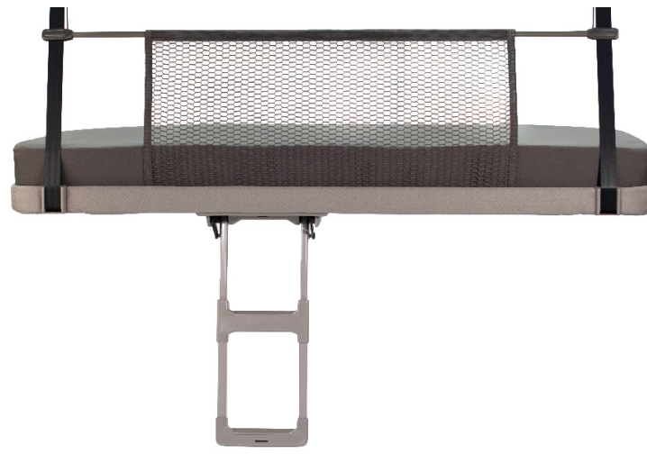
Upper bed in truck cab

The company develops and manufactures complete bed and cargo storage systems as integrated occupant restraint systems for truck cabs. For passenger cars and vans, the products consist of various cargo storage solutions, restraint systems and seat belts. The organization is an advanced partner for OEM's and Tier 1's in safety and comfort solutions for automotive applications.