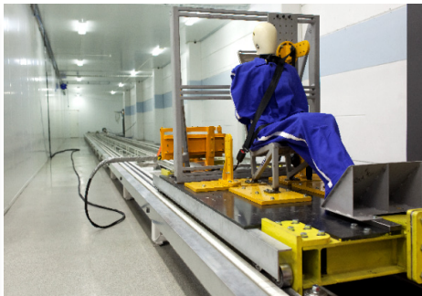
Crash test track