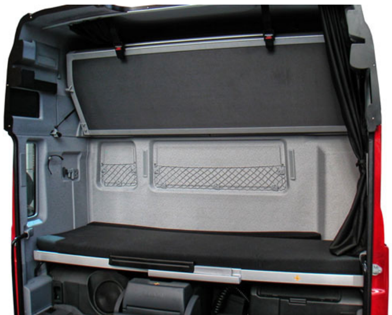
Truck cab interior