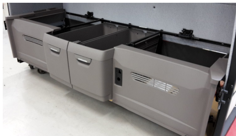
Storage system in truck cab