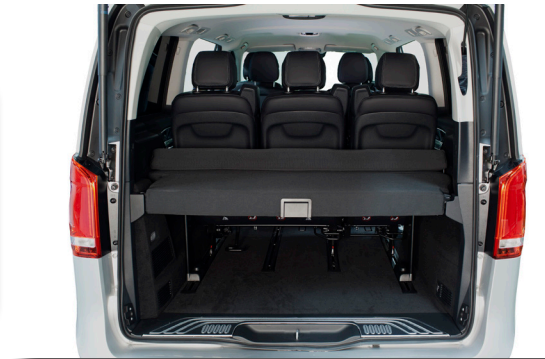
Luggage room divider/bed extender installed in car