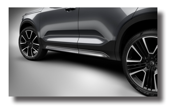
Lower door styling

Storage systems and cab components Preciform is a system supplier regarding storage solutions and interior cab components. In general the projects include technical development, testing, validation, component production and system assembly. Cab components include applications such as cup holders, trays, tables, covers, speaker grills, hatches, sun-visors etc.