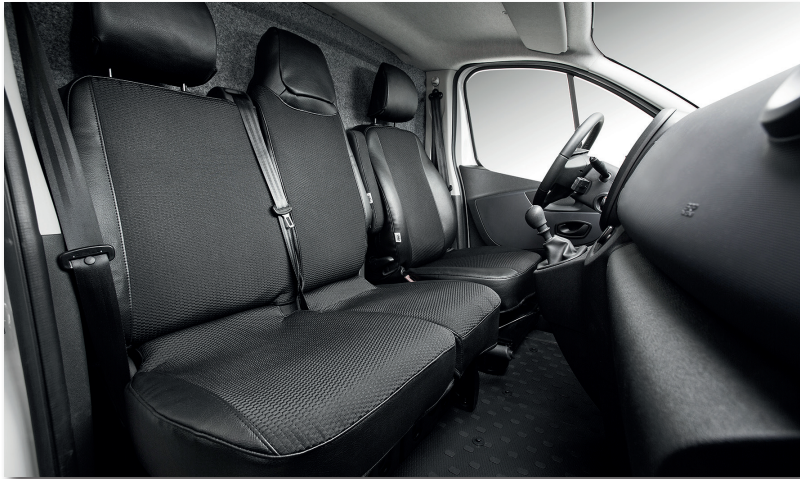
Interior, seat cover, design Transport 3.0

Of course you can also choose between all our other designs, vehicle type does not matter.