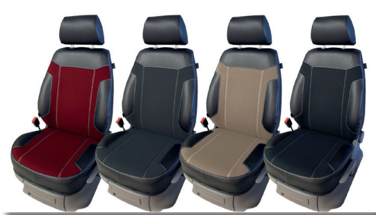
Design GT, four colour combinations