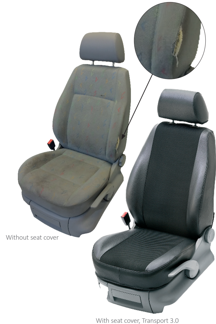
Without seat cover