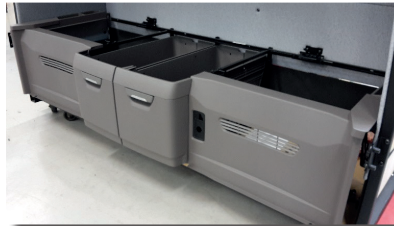
Storage system in truck cab