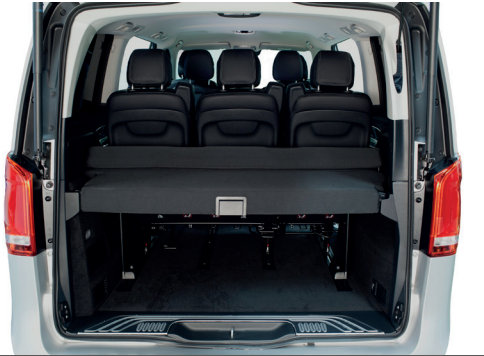
Luggage room divider/bed extender installed in car