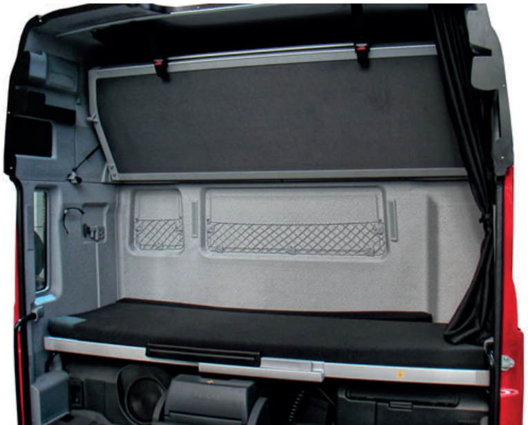
Truck cab interior