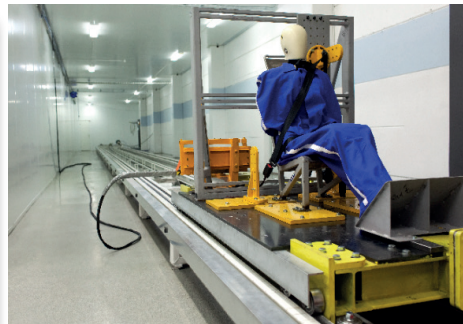
Crash test track