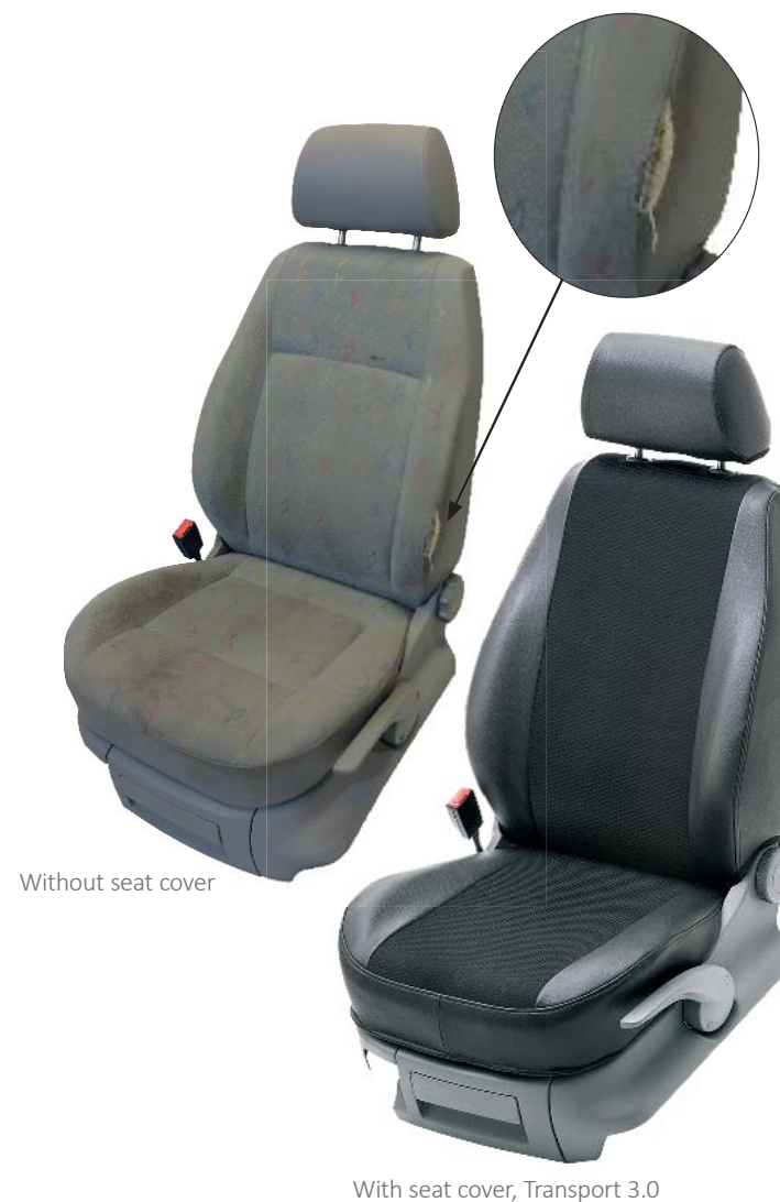
Without seat cover