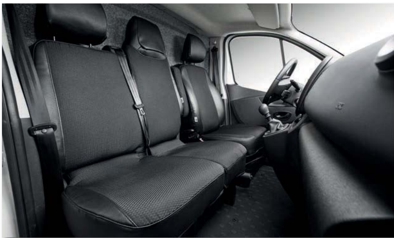
Interior, seat cover, design Transport 3.0

Of course you can also choose between all our other designs, vehicle type does not matter.