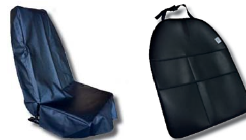
Temporary cover and kick protection

We produce and market a range of various accessories in textile, artificial leather or leather, for protection, storage and safety. We present tailor made solutions, all according to your needs.