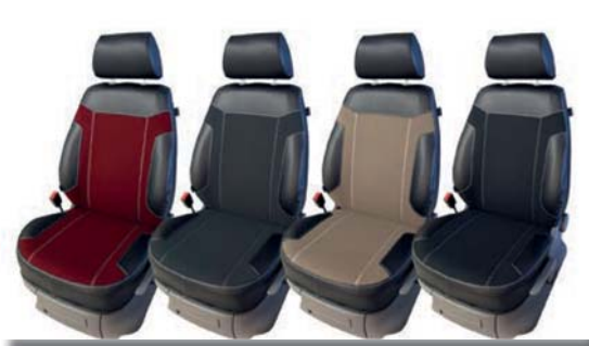
Design GT, four colour combinations