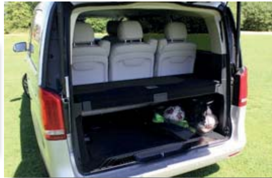
Luggage room divider installed