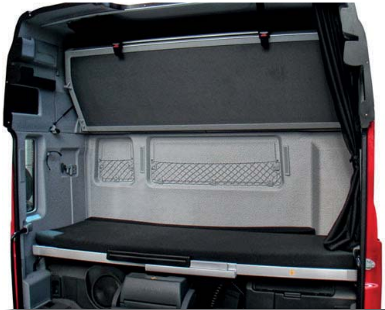
Truck cab interior