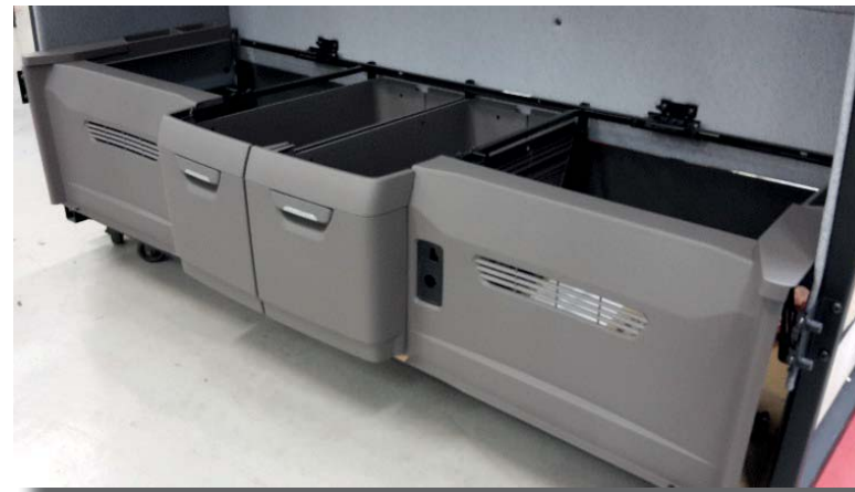
Storage system in truck cab