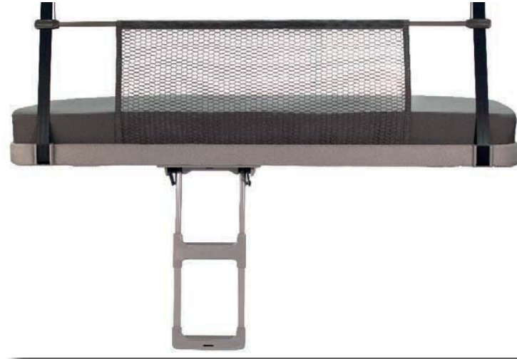
Upper bed in truck cab

The company develops and manufactures complete bed and cargo storage systems as integrated occupant restraint systems for truck cabs. For passenger cars and vans, the products consist of various cargo storage solutions, restraint systems and seat belts. The organization is a strong global partner for OEM's and Tier 1's in safety and comfort solutions for automotive applications.