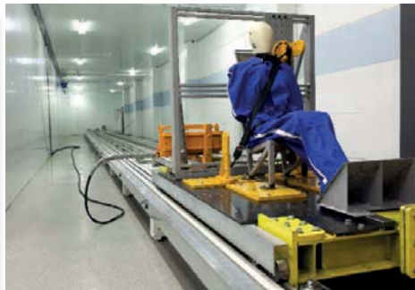
Crash test track