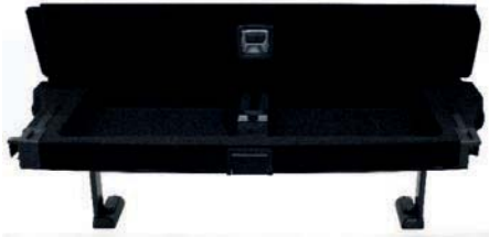
Luggage room divider