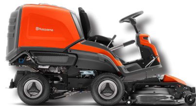
Housing- lawn mower