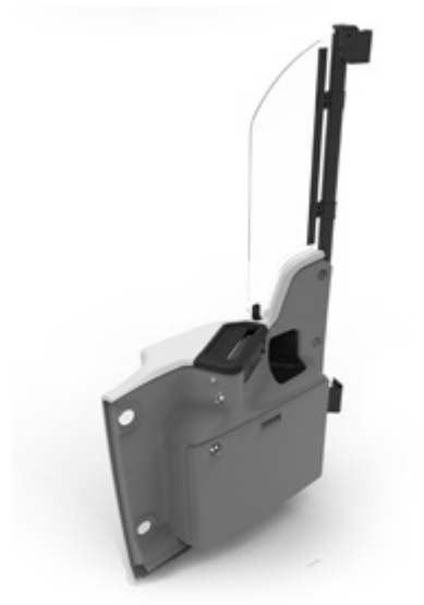
Drivers door- bus