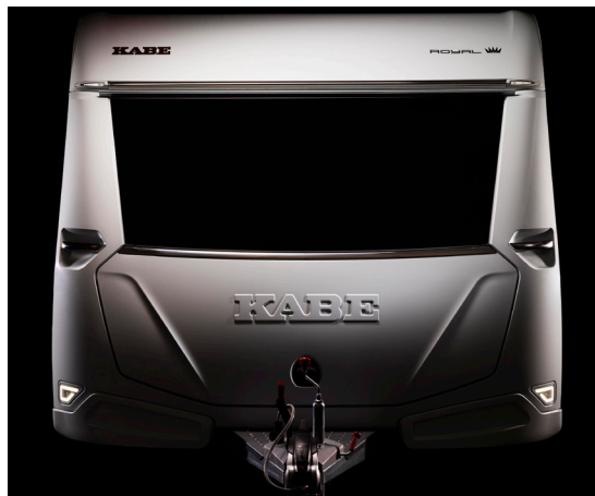
Front wall- caravan