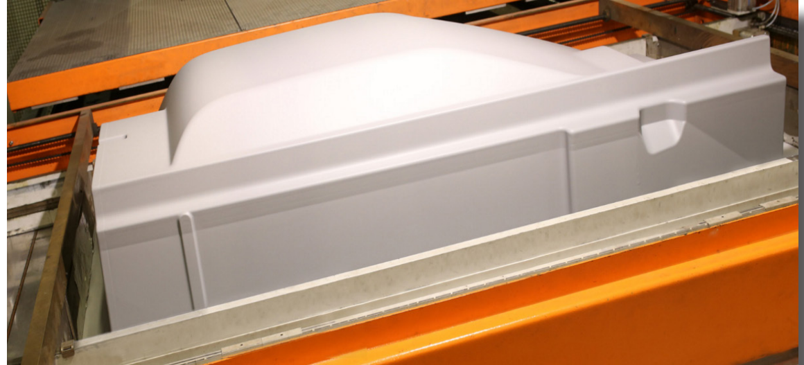
Vacuum-formed interior component

The innovative technical team takes the product ideas from our customers all the way to the best solution via design, prototyping, validation and industrial production.