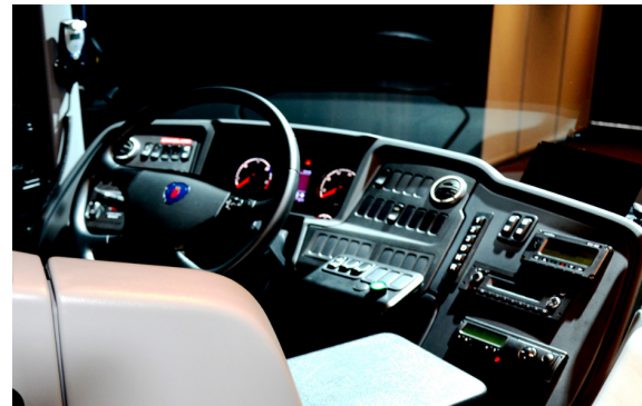
Dash board- bus

Exterior parts for automobiles include liners for all kinds of vehicles, bonnets and roofs for construction vehicles and aerodynamic elements on truck cabs.