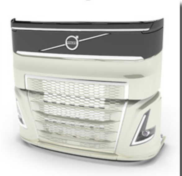
Aerodynamic front- truck