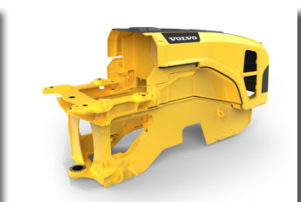
Bonnet- construction vehicle