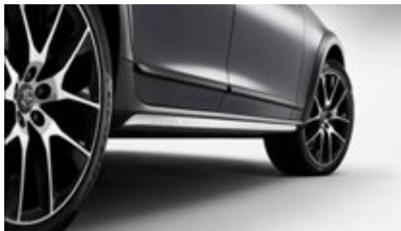
Side scuff plates