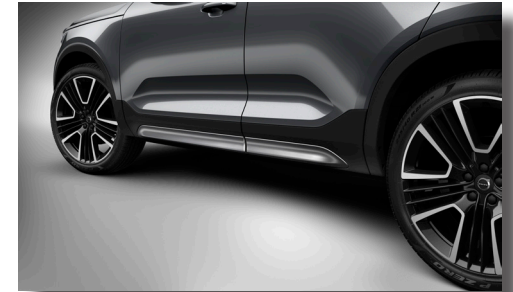
Lower door styling