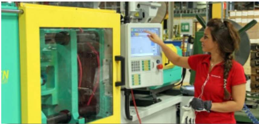
Injection moulding machine

Thermoplastic components are produced in machines with a clamping force from 50mt to 1300mt. All machines are equipped with robotized cells for component handling and assembly. The vibration and ultrasonic welding machines create thin shell-formed and rigid components.