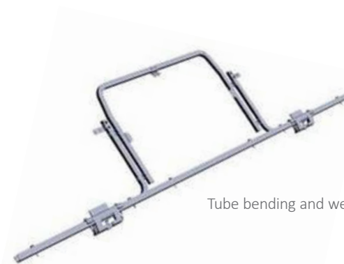
Tube bending and welding