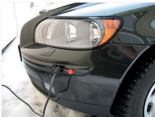
Connecting cable connected to the installed Calix system