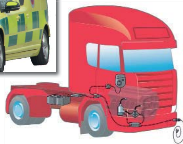
System overview- truck