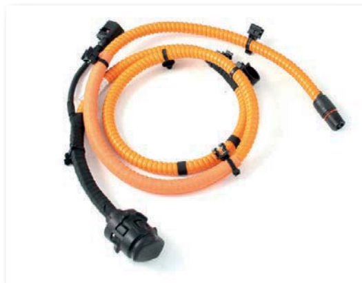
Calix Dual cables are approved for both EU and North America