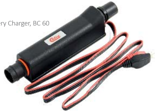
Battery Charger, BC 60